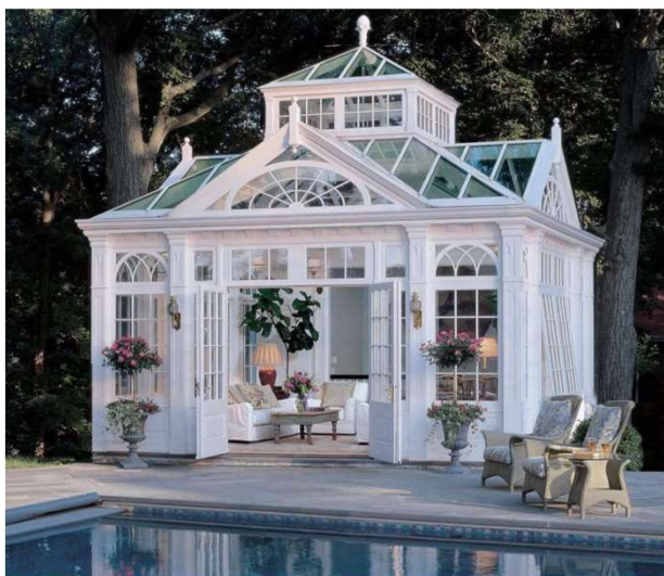
New York pool house