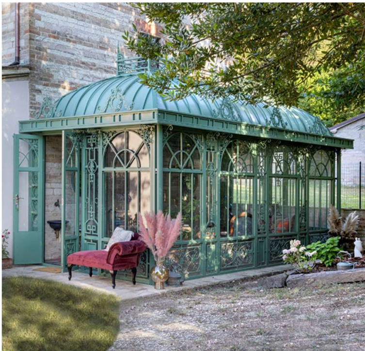
Abitazione privata – Urbino

By maintaining the original style even in the smallest details, the current technique allows production to be speeded up, guaranteeing high and constant quality standards. This creates elements that can be quickly assembled on site. And, with careful assembly, excellent levels of waterproofing and comfort are achieved without compromising the primary decorative purpose of these structures. The result turns out to be a new space, intermediate between home and garden