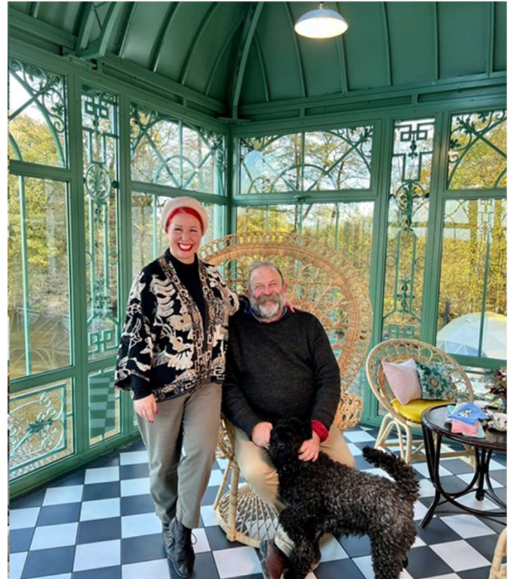
Chateau de La Motte-Husson, home of the TV show Escape to the chateau

A conservatory is always a good investment: for the private house owners it is about significantly increasing the value of their home and enjoying the atmosphere offered by the new living space, for business use (hospitality, events) being able to offer a highly fascinating atmosphere like this allows you to differentiate yourself substantially to the competitors, accessing a higher customer target and extending the season of outdoor events.