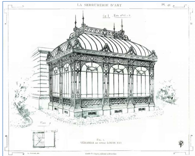
Louis Perraud Serrurerie d'art

Aphrodite's design is inspired by a French model from the late 19th century, a period between the end of the era of the eclectic Victorian style and the advent of art nouveau. The growth of industrial glass production in the same period helped the spread of these orangeries / winter gardens (or conservatories in England).